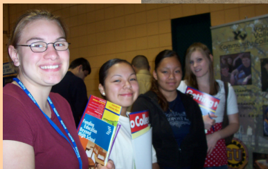
Attendees at the 2007 Youth Career & Job Fair.